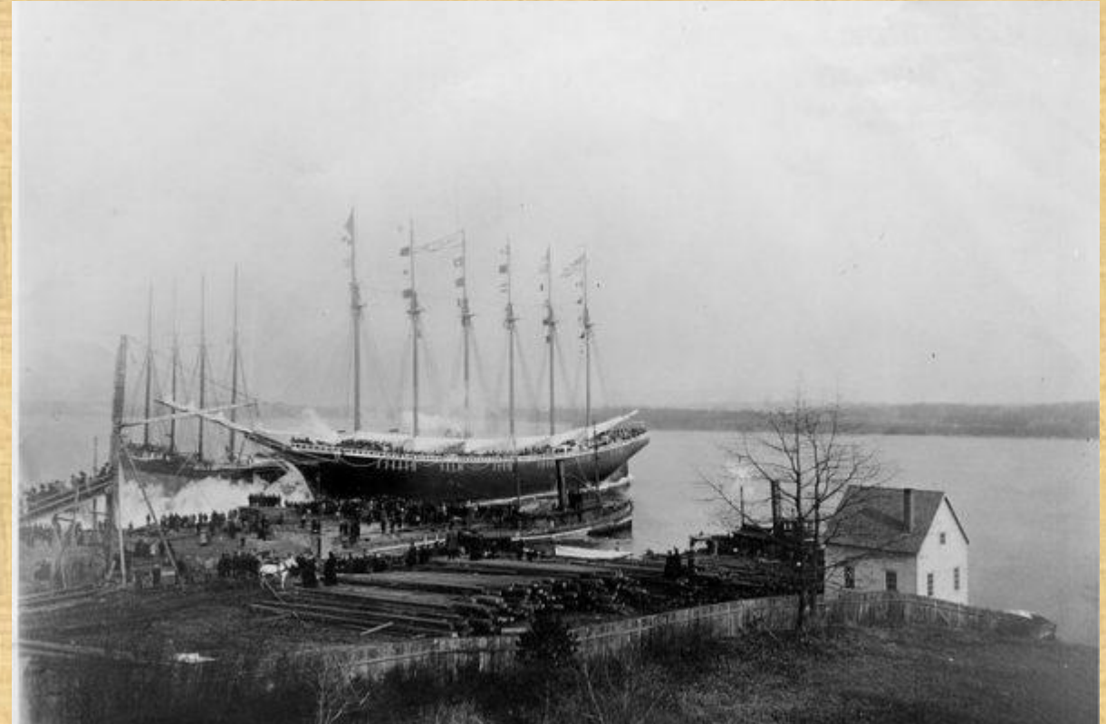
Early Picture of Percy and Small Boat Works