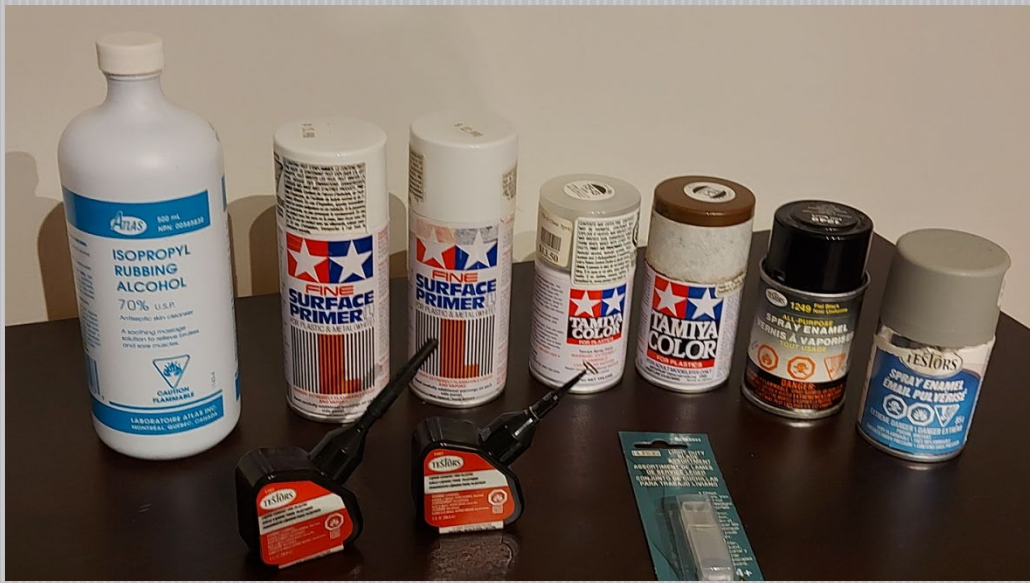
Paint, Glue, Isopropyl Rubbing Alcohol, blades (above) Plast-I-Weld, Extra Thin Cement, Stainless Steel T-pins, two Pipettes (below)