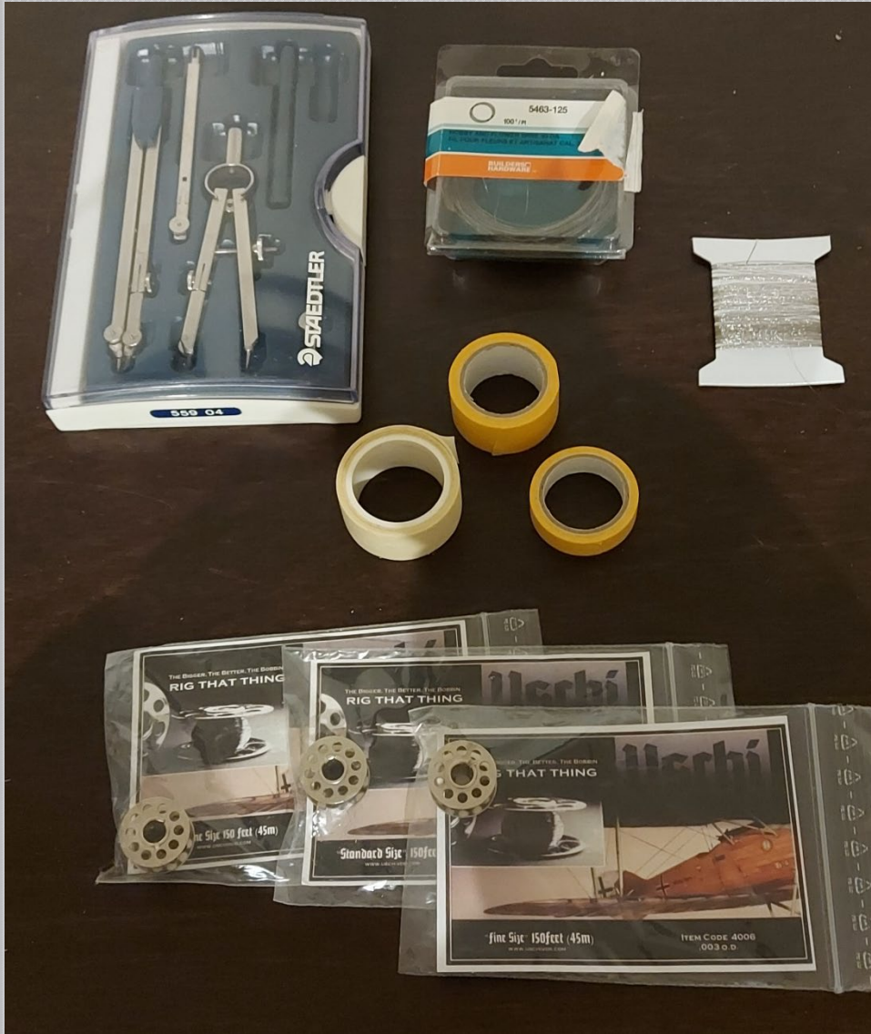
Compass set, 30 Ga.Wire, various Tapes, micro Rigging Threads