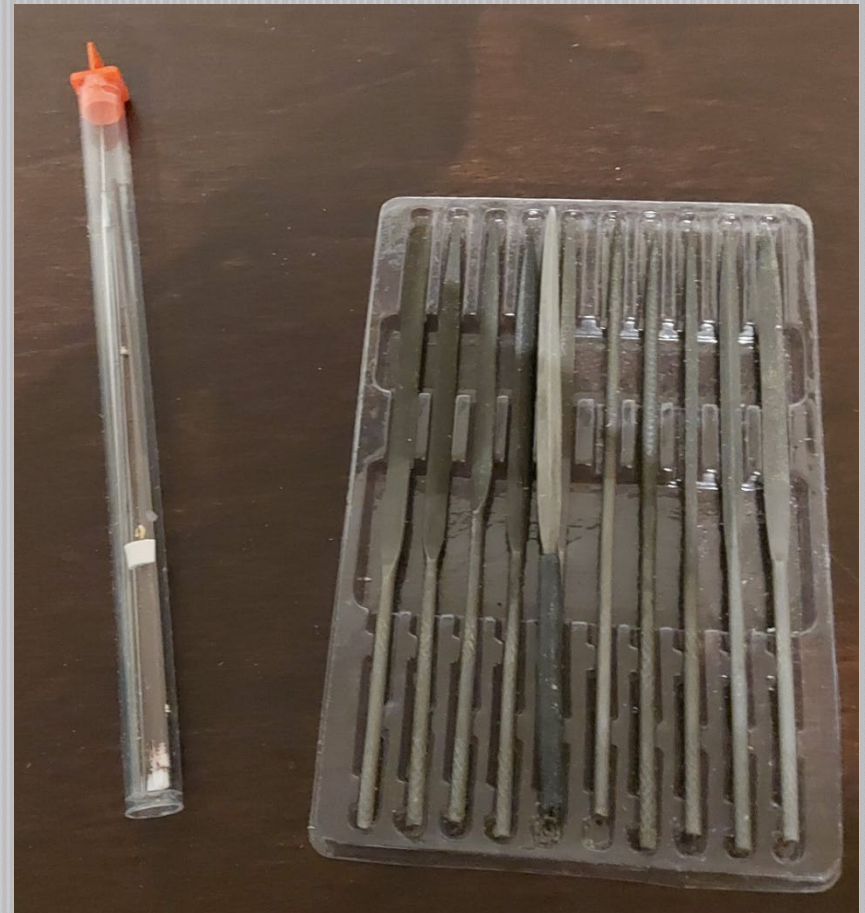
Tweezers, small Screw Drivers, Exacto Cutters, Needle Files, Pin Vise Drill, and bamboo skewers